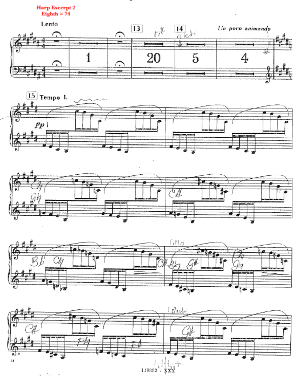
III. I pini del Gianicolo