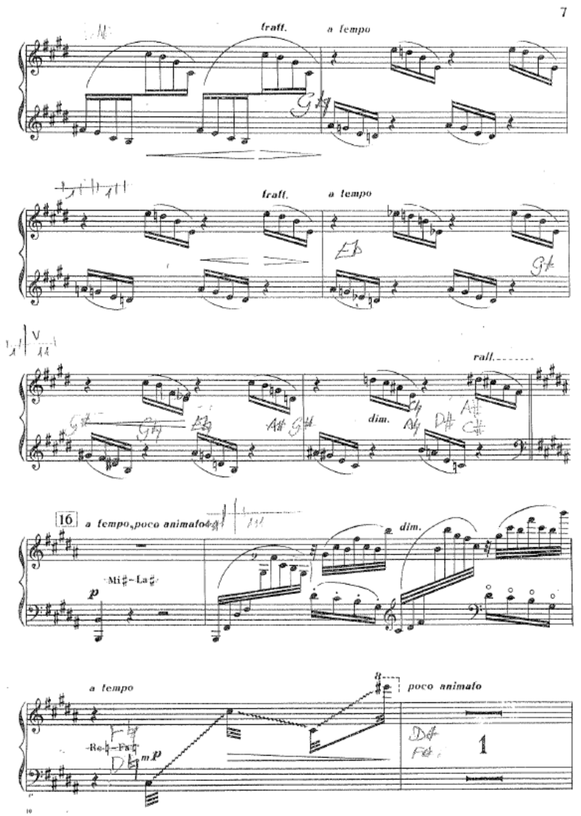
119882 - XXX